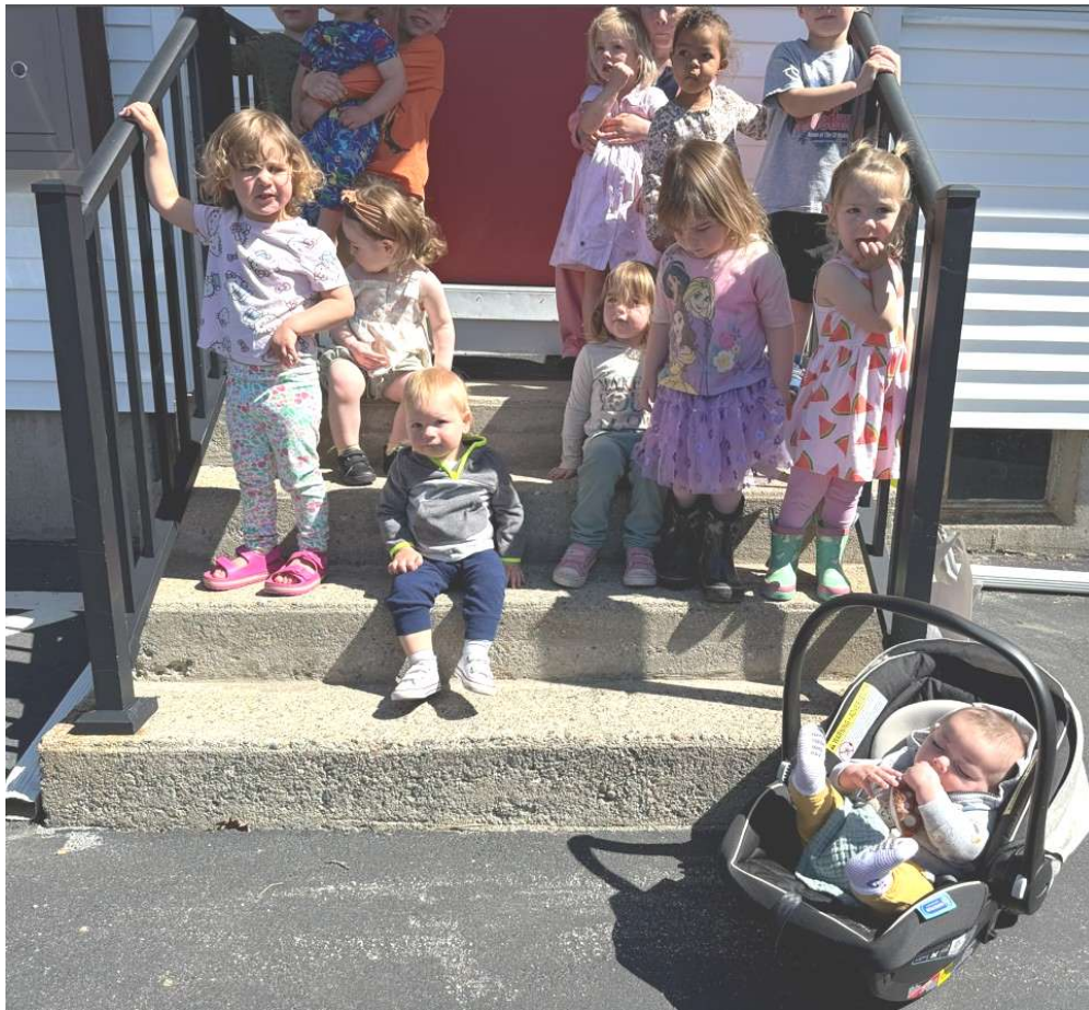
Family Music Spring 2026 – Next session in the new building!