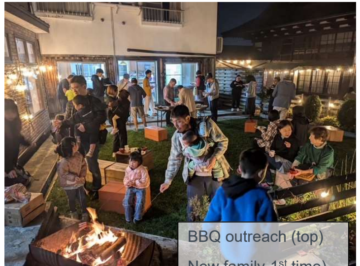
BBQ outreach (top) New family-1 st time

If we don't get distracted, every day we see the amazing tenacity of God and that he is working to bring new people and grow the new believers in the church. Church members are aware that