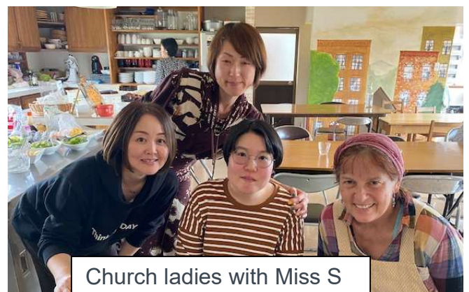
Church ladies with Miss S