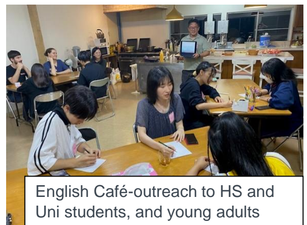
English Café-outreach to HS and Uni students, and young adults