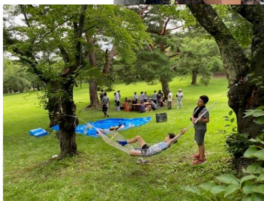
Overnight Church camp and outdoor worship service