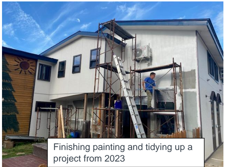
Finishing painting and tidying up a project from 2023

3) to be able to make a good reconnection with high school boy A and that God will draw him to himself.